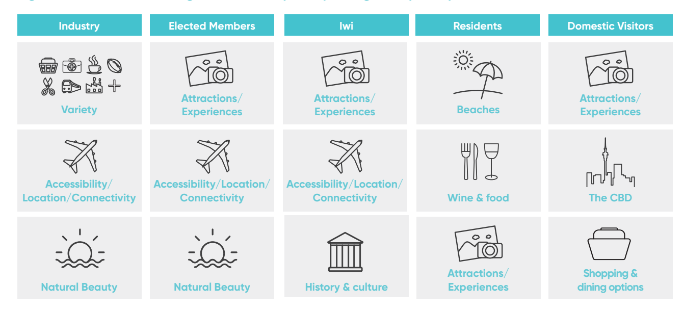
Figure 9: Consultation findings – Auckland's primary strengths (top 3 responses)

How Auckland is viewed as a destination differs depending on the market stakeholder group making the observation. Figure 9 illustrates how the primary strengths of Auckland were viewed by each of the groups surveyed.