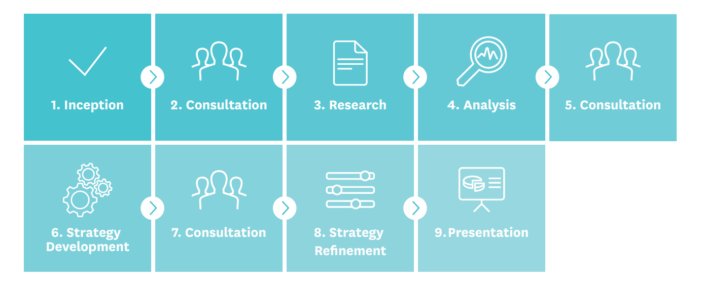
Figure 6: Methodology Process

Stage nine involved presenting the final Destination AKL 2025 report, seeking approval and adoption from the Mayor, ATEED Board and the Industry Leaders Group. The endorsement for the final strategy by the Mayor, ATEED Board and the Industry Leaders Group is acknowledged in the body of the strategy.